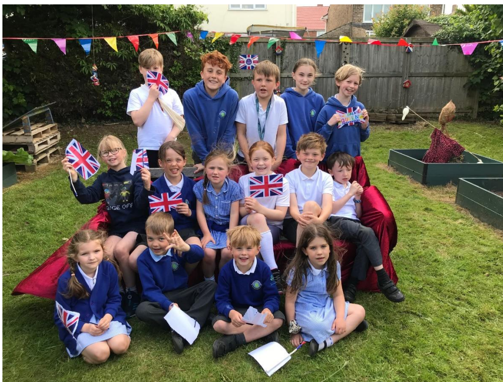
Our School Council 2021/22

To commemorate the Queen's platinum Jubilee we re-launched our Diamond Jubilee Garden to the Platinum Jubilee Garden. Each class worked hard to create something for the garden and Year 6 did some great work in pulling it all together ready for the grand opening! The School Council then finished off by burying our time capsule. Thank you for all of the work, photos and treasures which we managed to squeeze in! It certainly felt like a very special moment indeed.